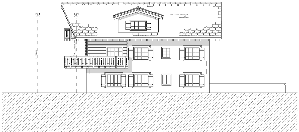
Ost - Fassade