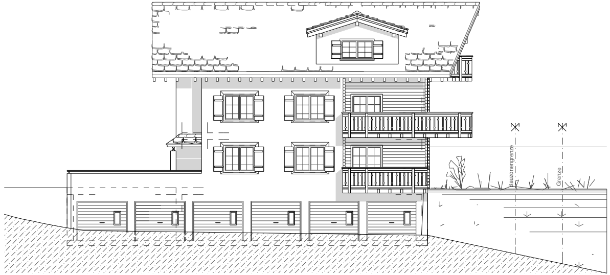
West - Fassade